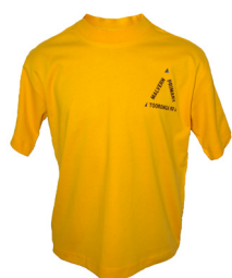
House T Shirt Gold