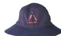
Hat with crest

For current prices, please refer to www.bobstewart.com.au