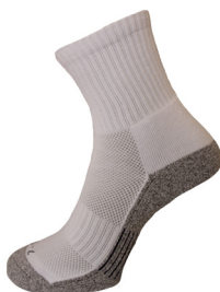
White Sports Sock