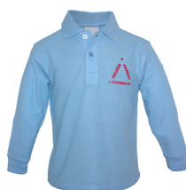
Polo Long Sleeve