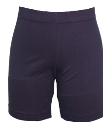
Bike Shorts Navy