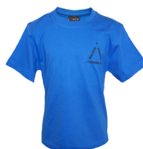
House T Shirt Blue