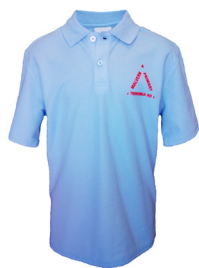
Polo Short Sleeve