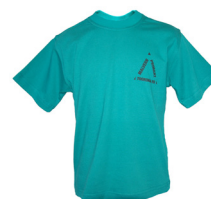
House T Shirt Green