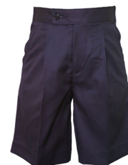
Shorts Fly Front Primary