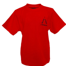
House T Shirt Red