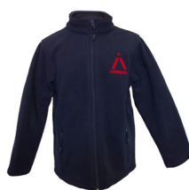
Polar Fleece Jkt