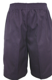
Shorts Pull On